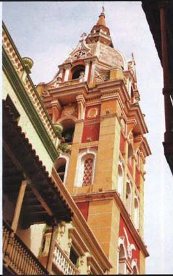
TRANSFORMATION VACATIONS Clockwise from top left: Exploring ice waves in Antarctica with Kensington Tours; inside the Marchesi di Barolo winery, in Piedmont, Italy, led by Country Walkers; cheese maker Silvio Pistone in Piedmont; the 17th-century Cartagena Cathedral, included on a Cox & Kings five-day Colombia tour; Egypt's Dendera Temple, on a trip with Abercrombie & Kent.

The Operator Off the Beaten Path The Highlights Escape the crowds in America's iconic desert landscape. Start with a lesson in canyoneering—exploring the slot canyons of Utah's Zion National Park by foot and rope—followed by a stay at the new Amangiri, near Lake Powell, in Utah. A three-day raft trip through the Grand Canyon includes hikes and gourmet food. >>