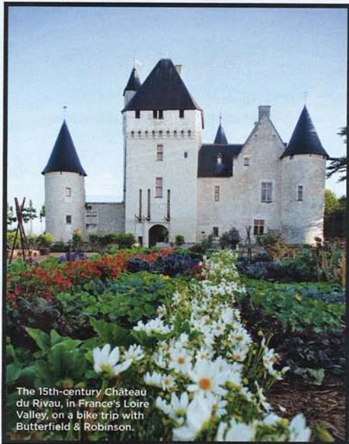
The 15th-century Château du Rivau, in France's Loire Valley, on a bike trip with Butterfield & Robinson.