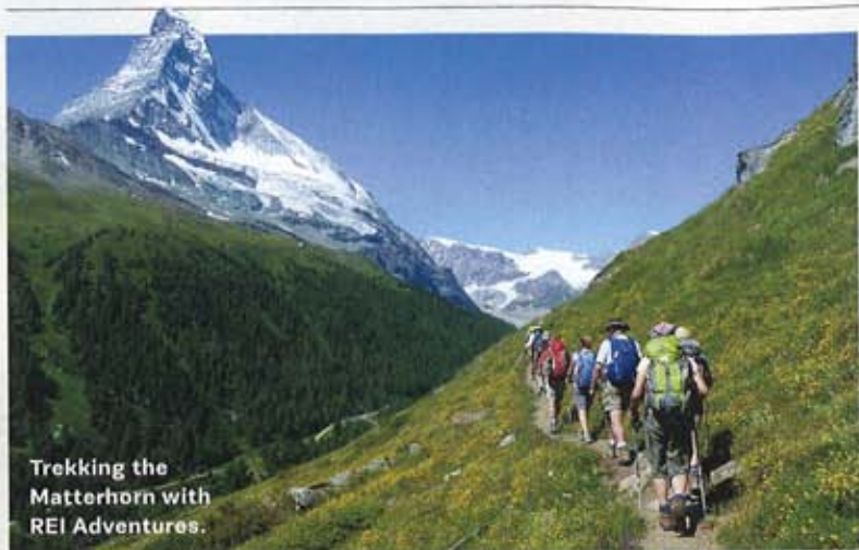
Trekking the Matterhorn with REI Adventures.